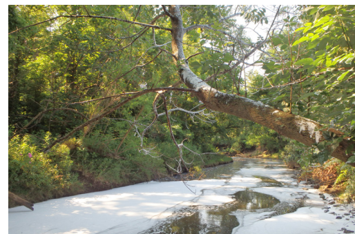
Stream full of suds from stormwater system

Know what qualifies as hazardous waste and make arrangements for its proper disposal. Ohio EPA's Division of Hazardous Waste Management can be reached at (614) 644-2934.