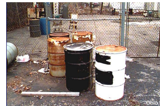
Improper outdoor storage—no secondary containment

Power washing water must be contained and disposed of either to a sanitary sewer, possibly after pre-treatment, or as hazardous waste. Before hiring a contractor, know what he or she does with wastewater.