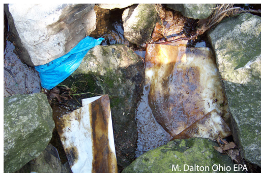
Pads used to absorb cooking oil that entered a stream from improper filter cleaning

Work done outside must be on a hard surface (not soil or gravel) with a drain to pre-treatment and a sanitary sewer system or another containment and collection system.